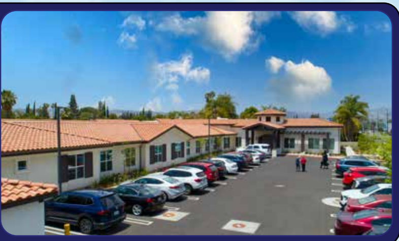
Woodland Hills, CA

To view the full SLF investment portfolio, visit https://slfinvestments.com/portfolio .