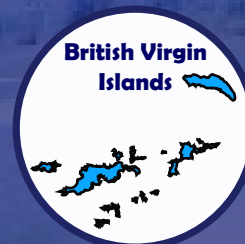
British Virgin Islands