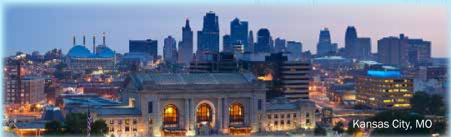
Kansas City, MO