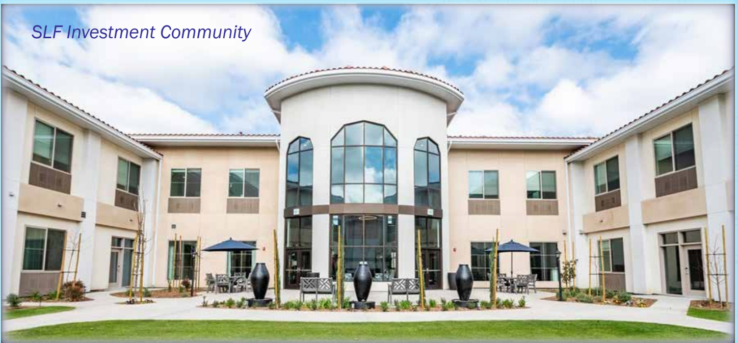
SLF Investment Community

Our range of investment funds provide capital to senior housing developers and operators across the USA. They utilize the funds as part of their overall capital solution for the development, construction, and operation of new senior living communities. In addition, SLF provides capital for the acquisition of existing communities that are either economically stabilized, or offer the opportunity for increased value through rehabilitation. Once matured , the investment communities return investment capital and associated profits to the respective SLF investment funds, who then distribute investment capital and associated profits back to the investor - That's You!