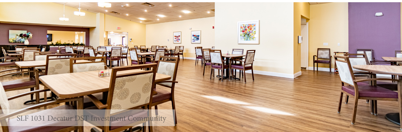
SLF 1031 Decatur DST Investment Community